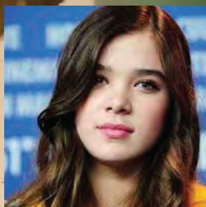
Hailee Steinfeld (Type)