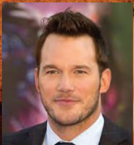
Chris Pratt (Type)

There are girls being taken and those who try to save them. But, their rescue could mean risking everything.