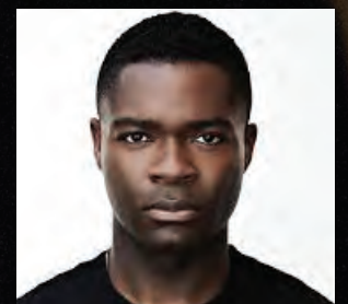
David Oyelowo (Type)