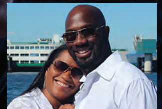
RICHARD T. JONES, ACTOR